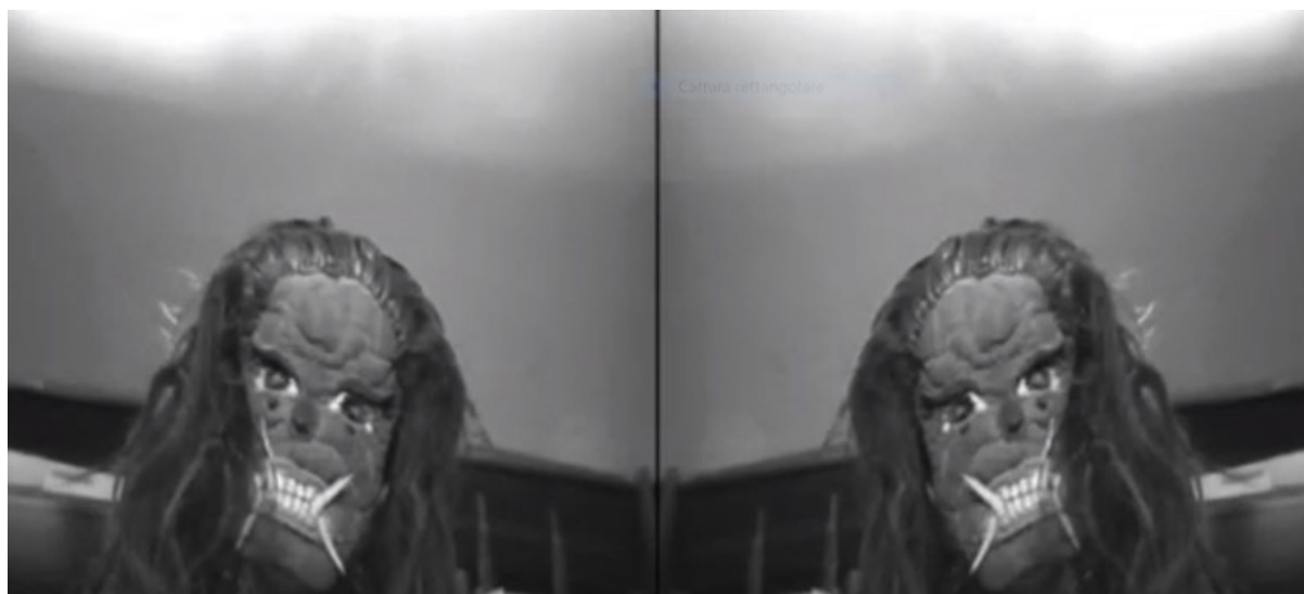
NIL YALTER Shaman , 1979, video in black and white, edition 1/5

In 2019, the MacVal devoted a solo exhibition to her entitled «TRANS/HUMANCE». In 2018, she received the AWARE (Archives of Women Artists, Research and Exhibitions) honorary award. Nil Yalter is the recipient of the Golden Lion for Lifetime Achievement of the Venice Biennale 2024. Next summer, Adriano Pedrosa, curator of the Venice Biennale 2024, will devote an entire room in the Arsenale to her work.