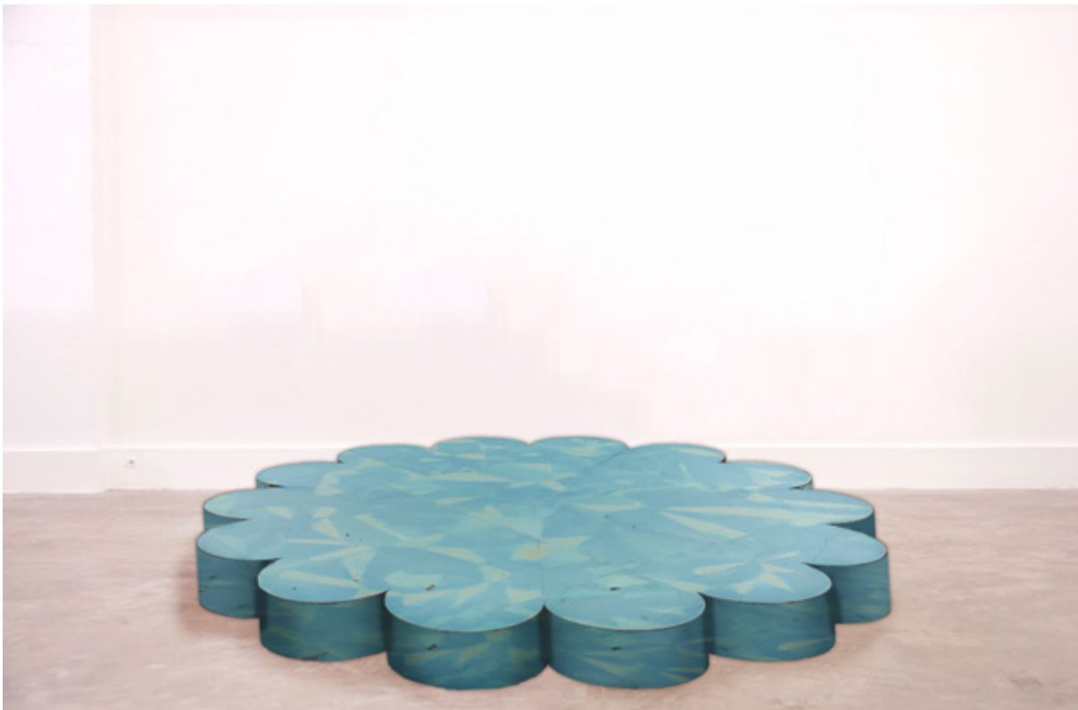
HUSSEIN NASSEREDDINE A Few Decent Ways To Drown , 2022, limestone, steel, carbon paper and sunlight, 320 x 300 x 27cm

His first book How To See The Columns As Palm Trees was published in 2020 with independent publishers Kayfa ta.