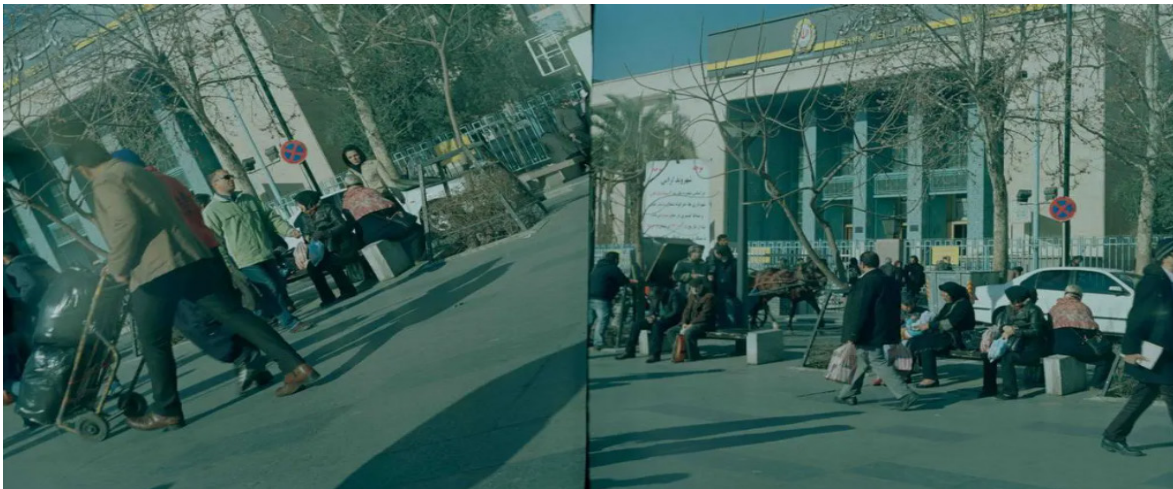
(1) MOHAMMAD GHAZALI Dredge #11 - Center for astronomical studies south Jamalzadeh , 2017, analog photography, 39 x 29 cm