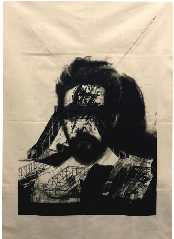
(1) Baktash SARANG, The eternal inner reconstruction , pencil on paper, 150 x 100 cm, 2023